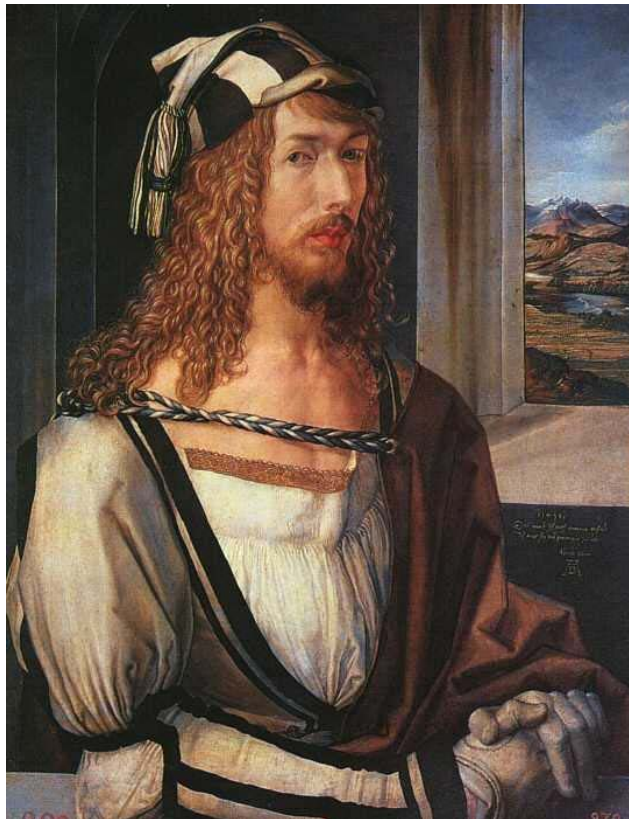
Self-portrait of Albrecht Dürer